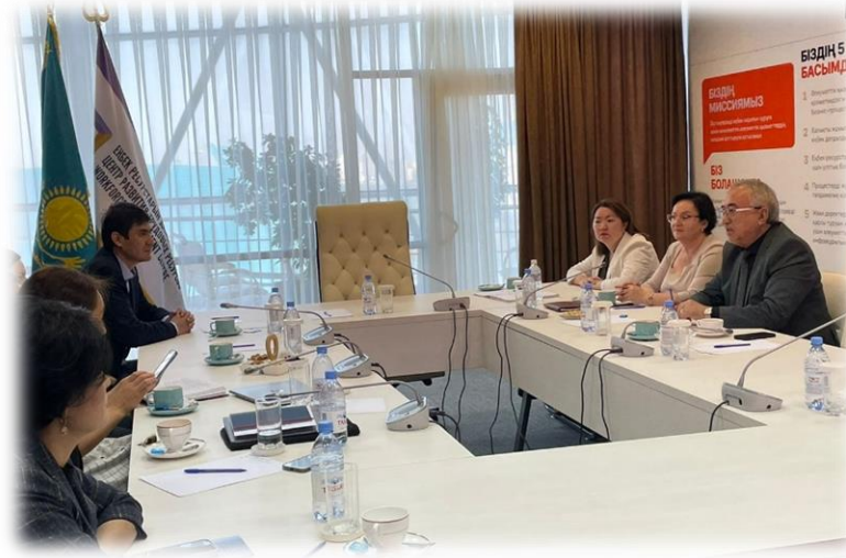
Meeting with the Vice Minister of Labor and Social Protection of the Population of the Republic of Kazakhstan, 2022