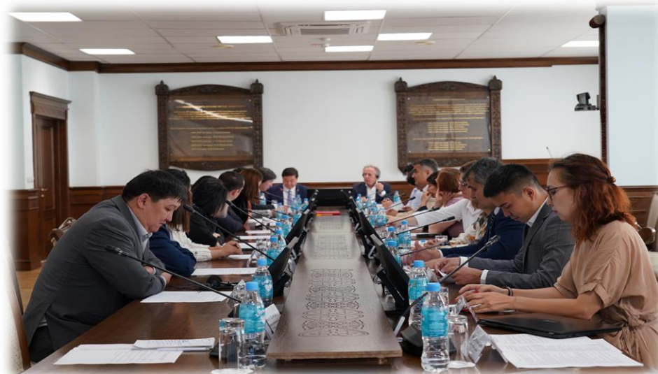
Technical meeting of the SOLID project May 24-25, Nur-Sultan, 2022