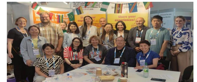
AIDS Conference in Munich, 2024