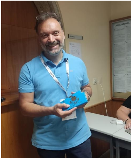
President of European Association of Schools of SW

International cooperation with practitioners, researchers, teachers and students from different universities of Europe, South America, Canada, Philippines, Chile and etc.