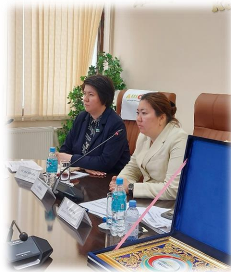
Cooperation with Deputies of the Mazhilis and the Senate of the Parliament of the Republic of Kazakhstan