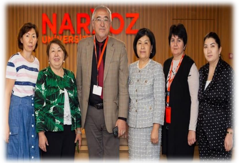
Cooperation with Higher educational institutions of the Republic of Kazakhstan