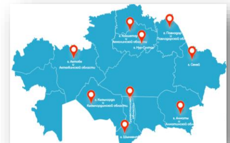
NGO "National Alliance of Professional Social Workers" 11 branches