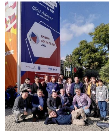
Lisbon Addictions Conference - 2022