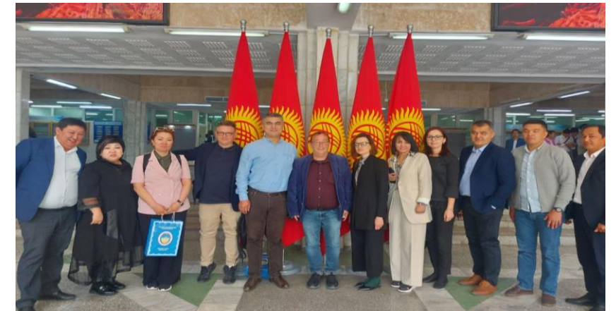
Technical meeting in Bishkek, Kyrgyzstan, 2023