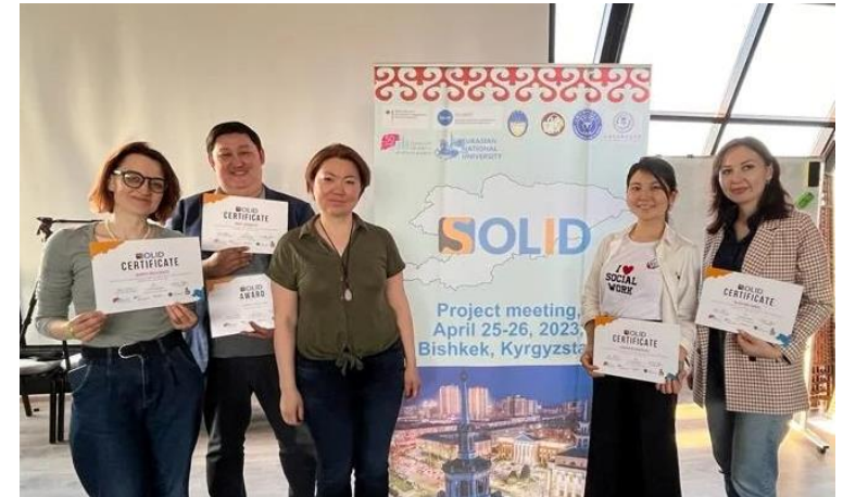
SOLID Kazakhstan team